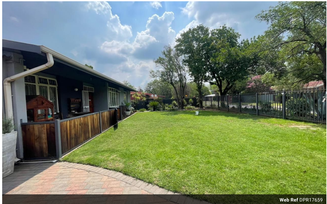
Web Ref DPR17659

Shop 2, The Palms Shopping Center, Louis Trichardt Blvd, Vanderbijlpark, 1911