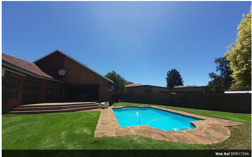
Web Ref DPR17204

Shop 2, The Palms Shopping Center, Louis Trichardt Blvd, Vanderbijlpark, 1911