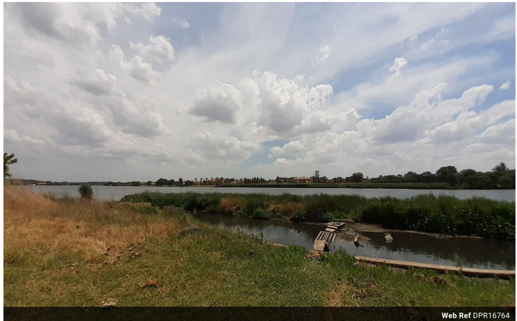
Web Ref DPR16764

Shop 2, The Palms Shopping Center, Louis Trichardt Blvd, Vanderbijlpark, 1911