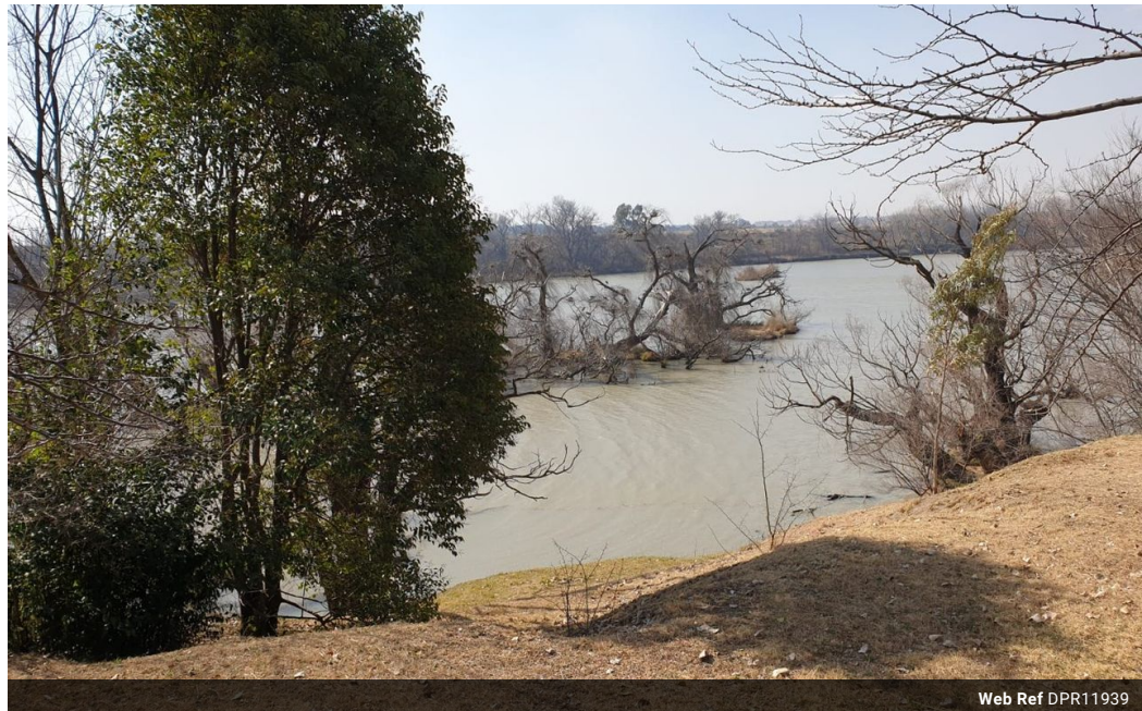
Web Ref DPR11939

Shop 2, The Palms Shopping Center, Louis Trichardt Blvd, Vanderbijlpark, 1911