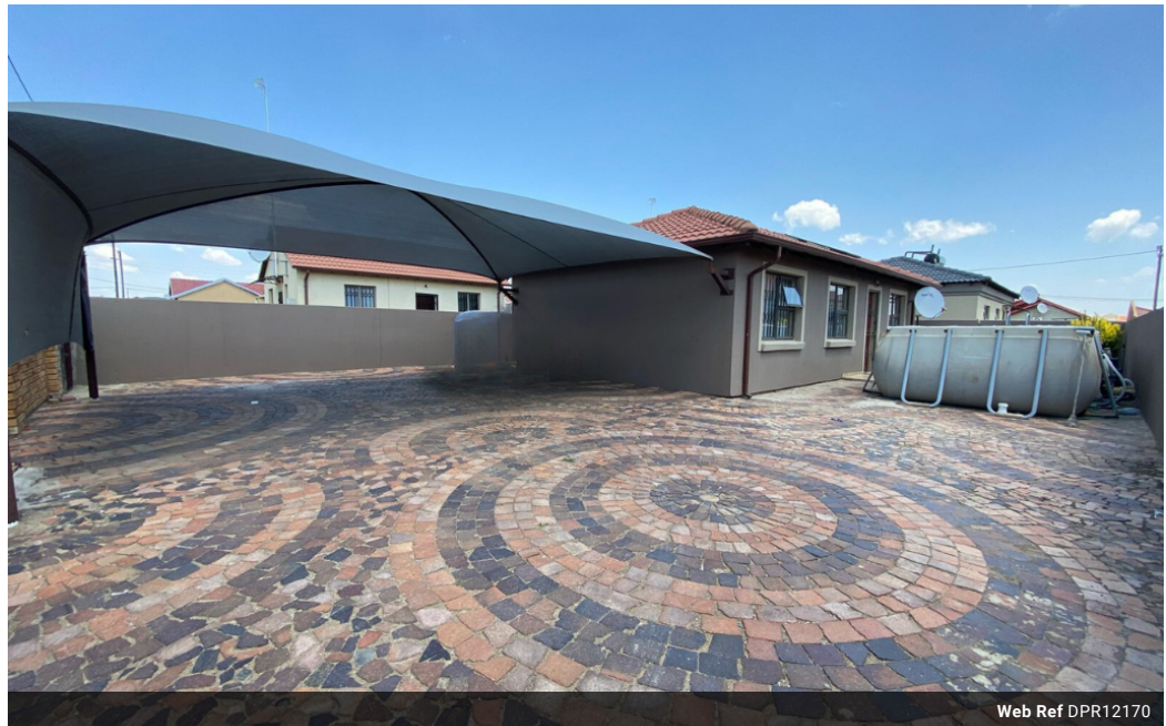
Web Ref DPR12170

Shop 2, The Palms Shopping Center, Louis Trichardt Blvd, Vanderbijlpark, 1911