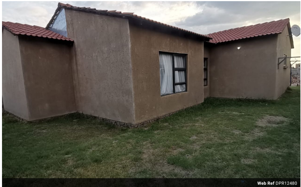
Web Ref DPR12480

Shop 2, The Palms Shopping Center, Louis Trichardt Blvd, Vanderbijlpark, 1911