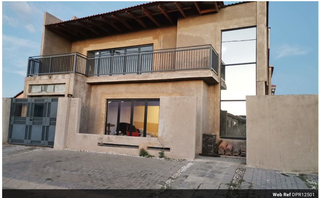
Web Ref DPR12501

Shop 2, The Palms Shopping Center, Louis Trichardt Blvd, Vanderbijlpark, 1911