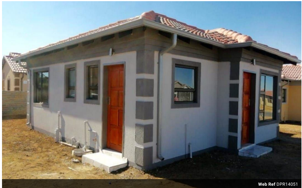
Web Ref DPR14051

Shop 2, The Palms Shopping Center, Louis Trichardt Blvd, Vanderbijlpark, 1911