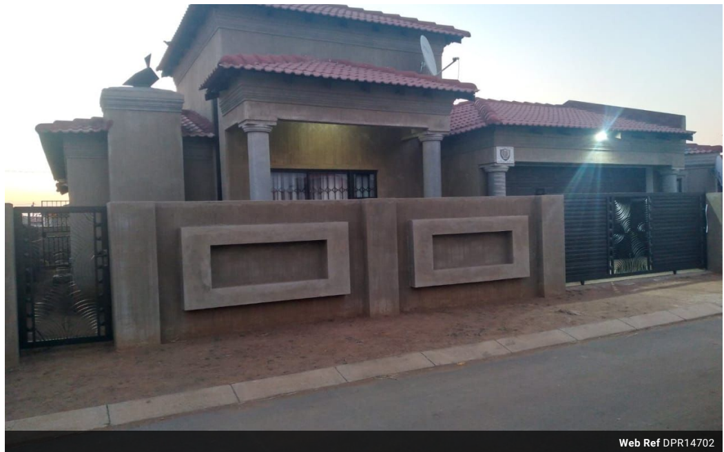
Web Ref DPR14702

Shop 2, The Palms Shopping Center, Louis Trichardt Blvd, Vanderbijlpark, 1911