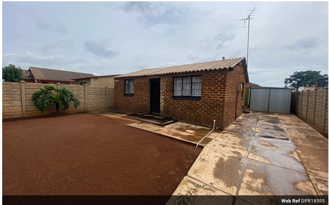
Web Ref DPR18595

Shop 2, The Palms Shopping Center, Louis Trichardt Blvd, Vanderbijlpark, 1911