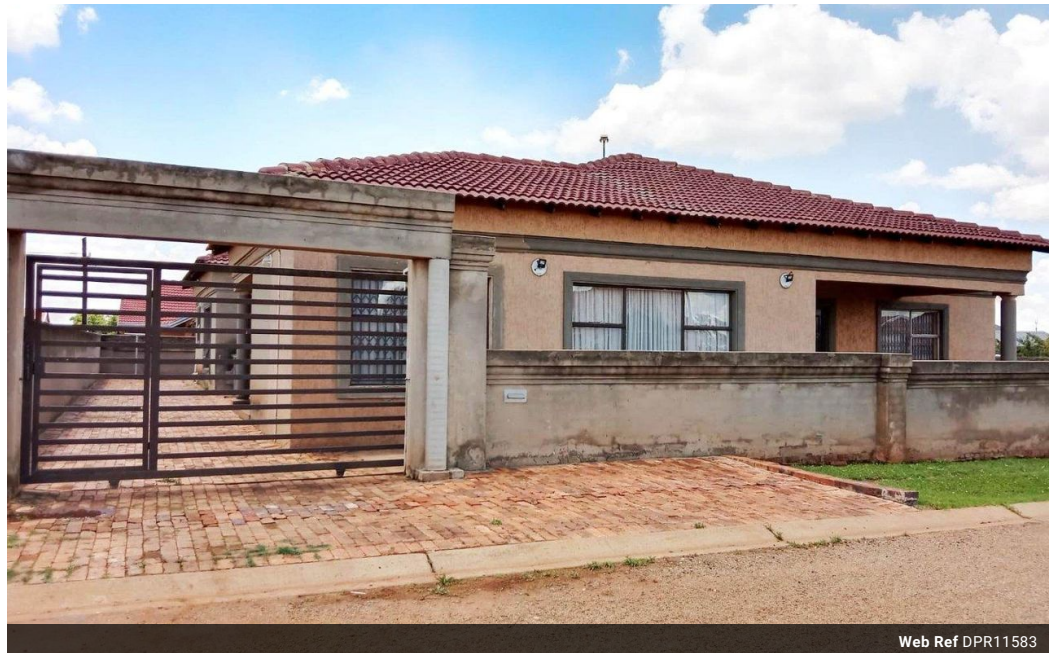
Web Ref DPR11583

Shop 2, The Palms Shopping Center, Louis Trichardt Blvd, Vanderbijlpark, 1911