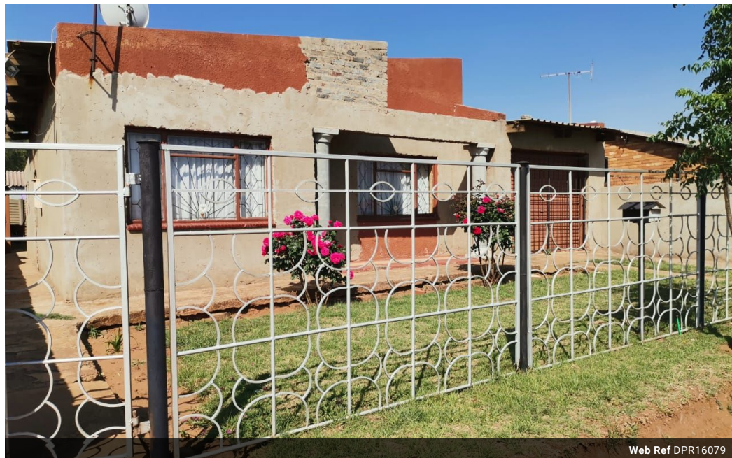
Web Ref DPR16079

Shop 2, The Palms Shopping Center, Louis Trichardt Blvd, Vanderbijlpark, 1911