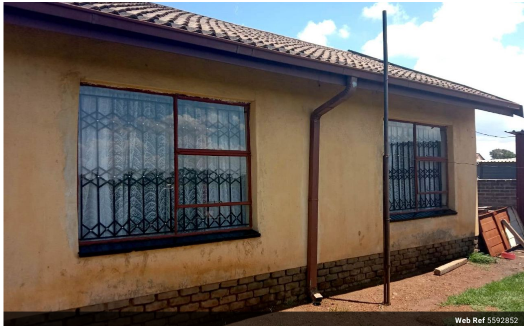
Web Ref 5592852

18 Klip River Drive, Three Rivers, Vereeniging