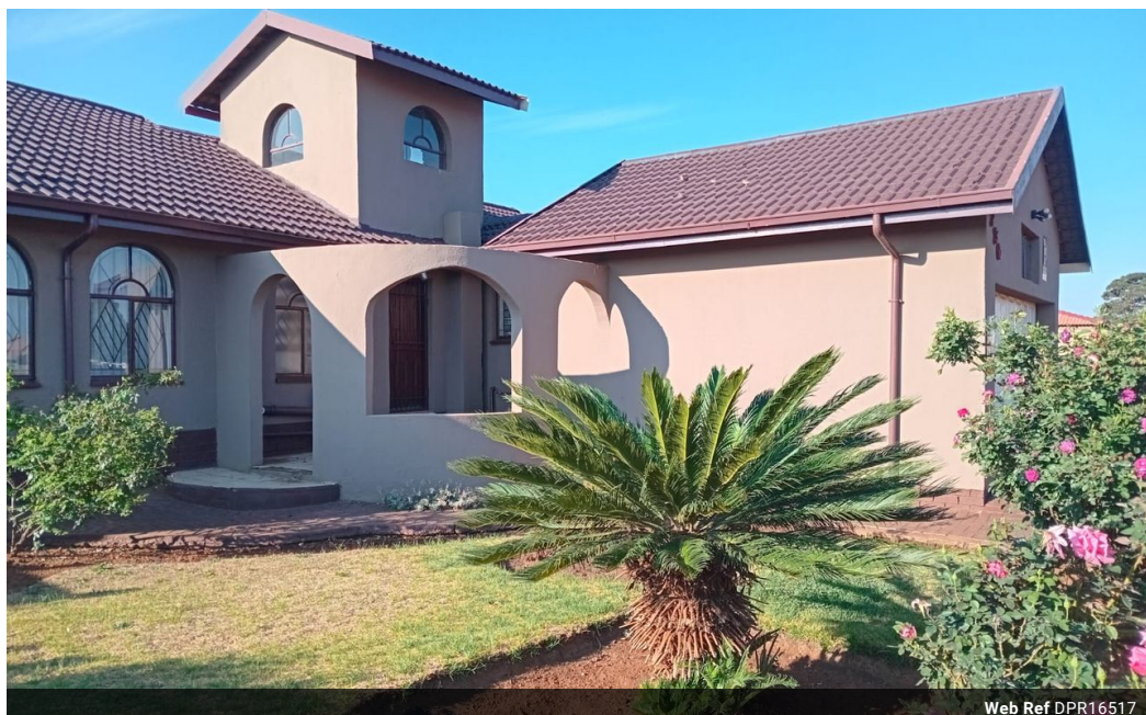
Web Ref DPR16517

Shop 2, The Palms Shopping Center, Louis Trichardt Blvd, Vanderbijlpark, 1911