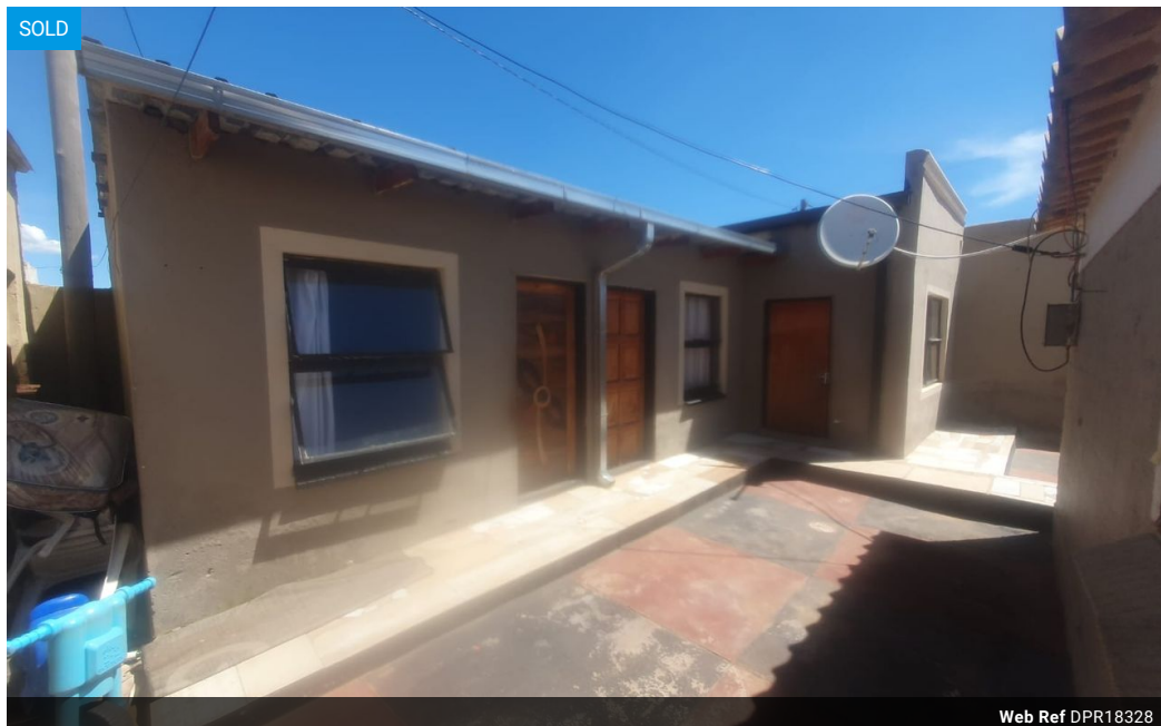
Web Ref DPR18328

18 Klip River Drive Three Rivers Vereeniging