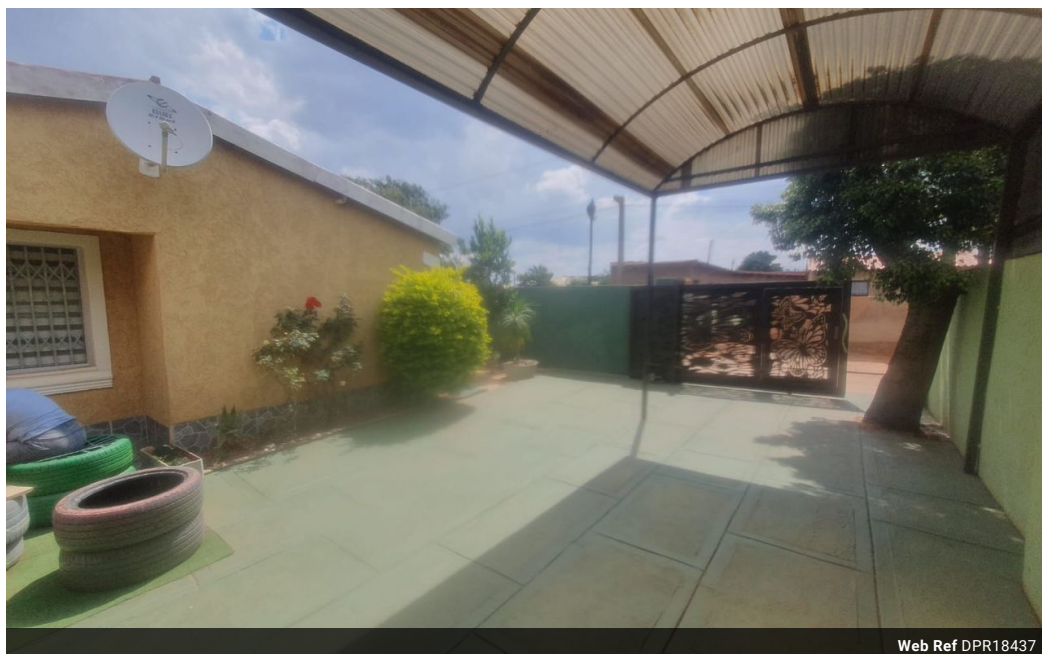
Web Ref DPR18437

24 Glynn Street Rothdene, Meyerton, 1961