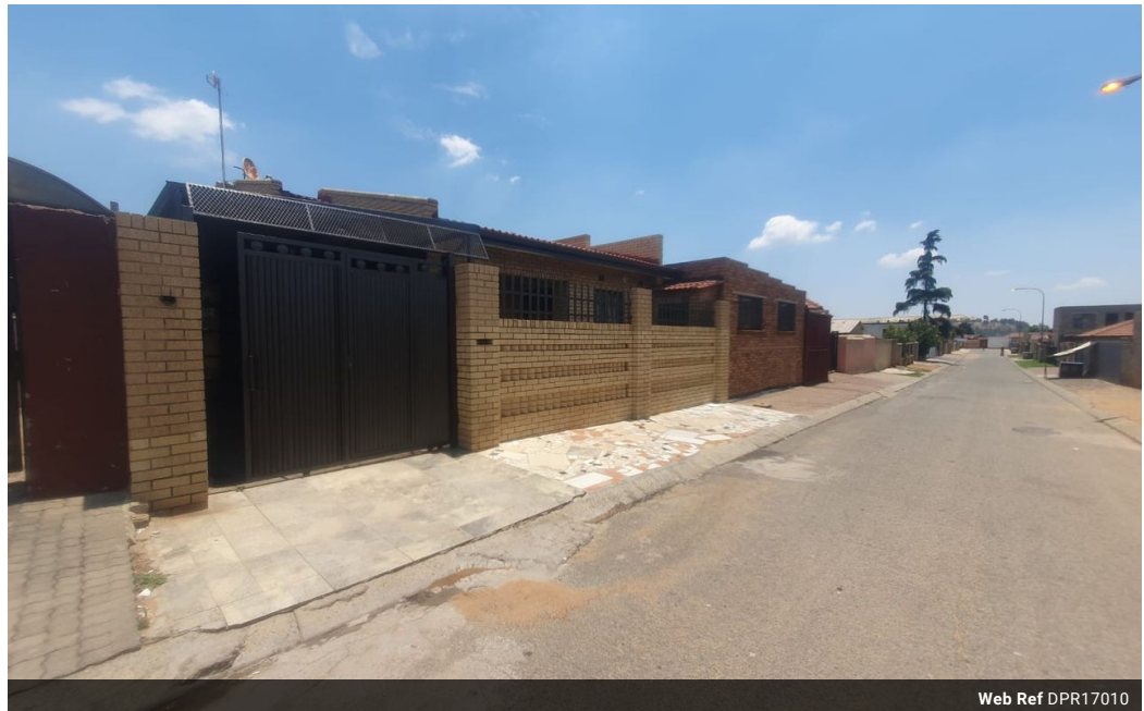
Web Ref DPR17010

24 Glynn Street Rothdene, Meyerton, 1961