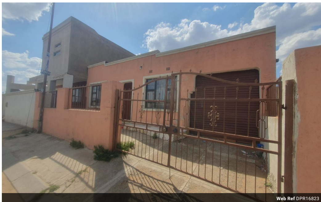
Web Ref DPR16823

24 Glynn Street Rothdene, Meyerton, 1961