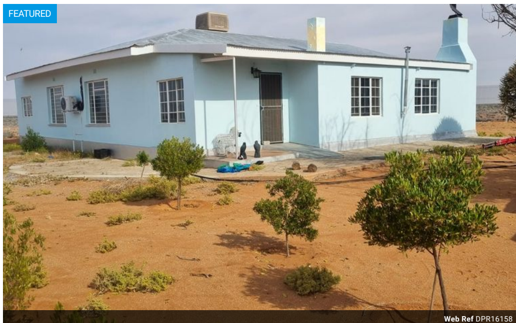
Web Ref DPR16158