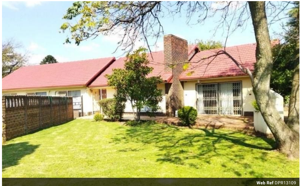
Web Ref DPR13109

18 Klip River Drive Three Rivers Vereeniging