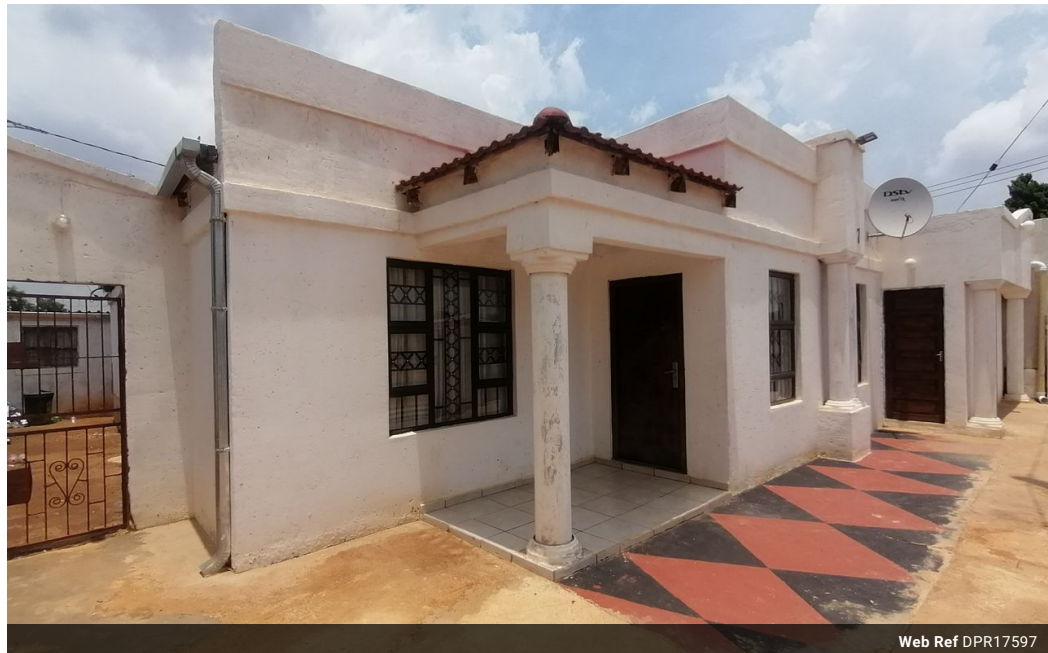
Web Ref DPR17597