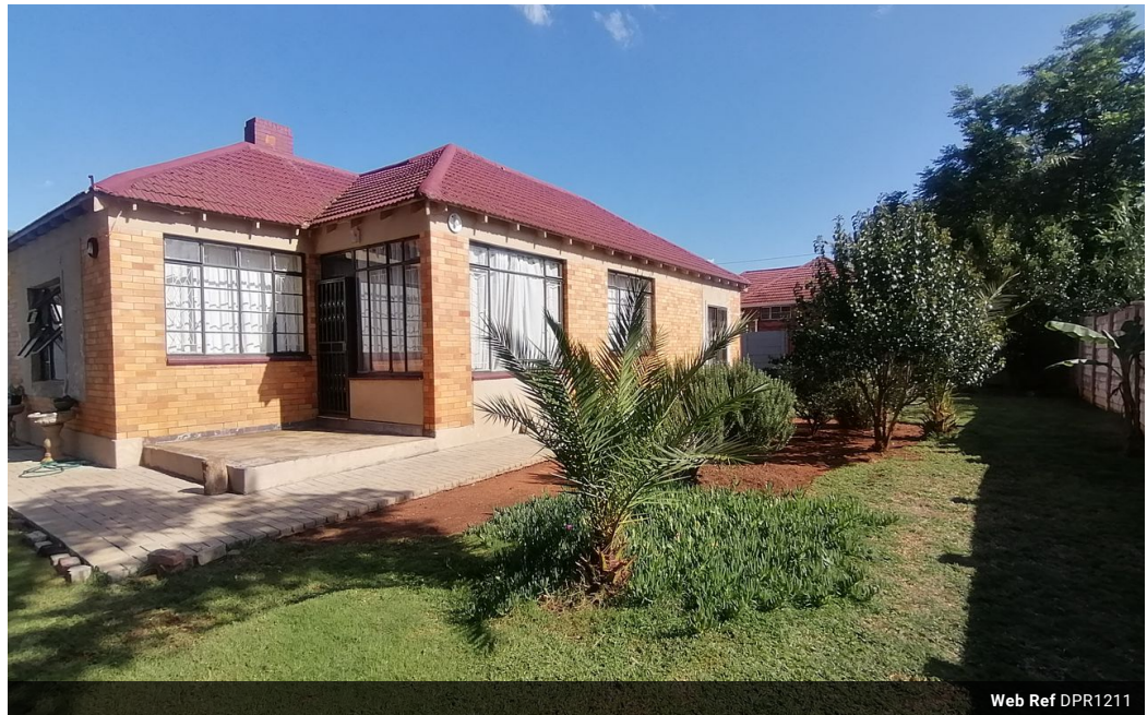
Web Ref DPR1211