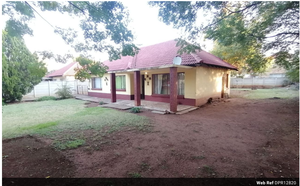
Web Ref DPR12820