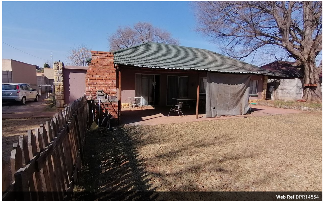
Web Ref DPR14554