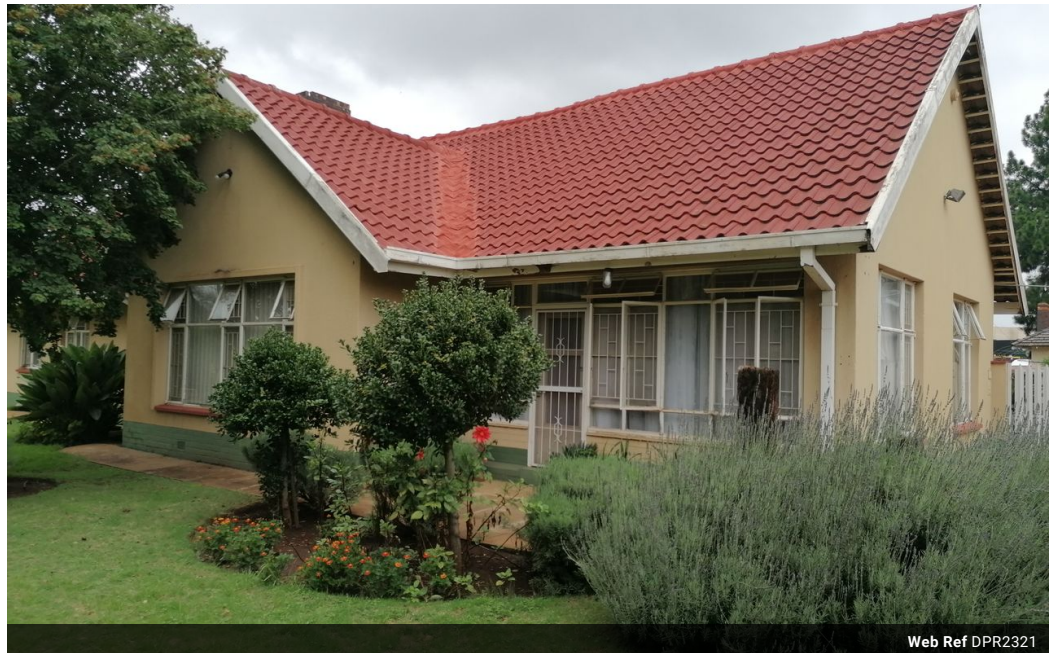
Web Ref DPR2321