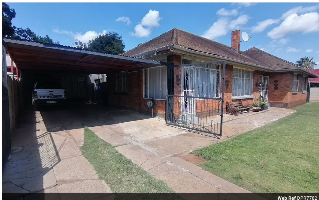
Web Ref DPR7782