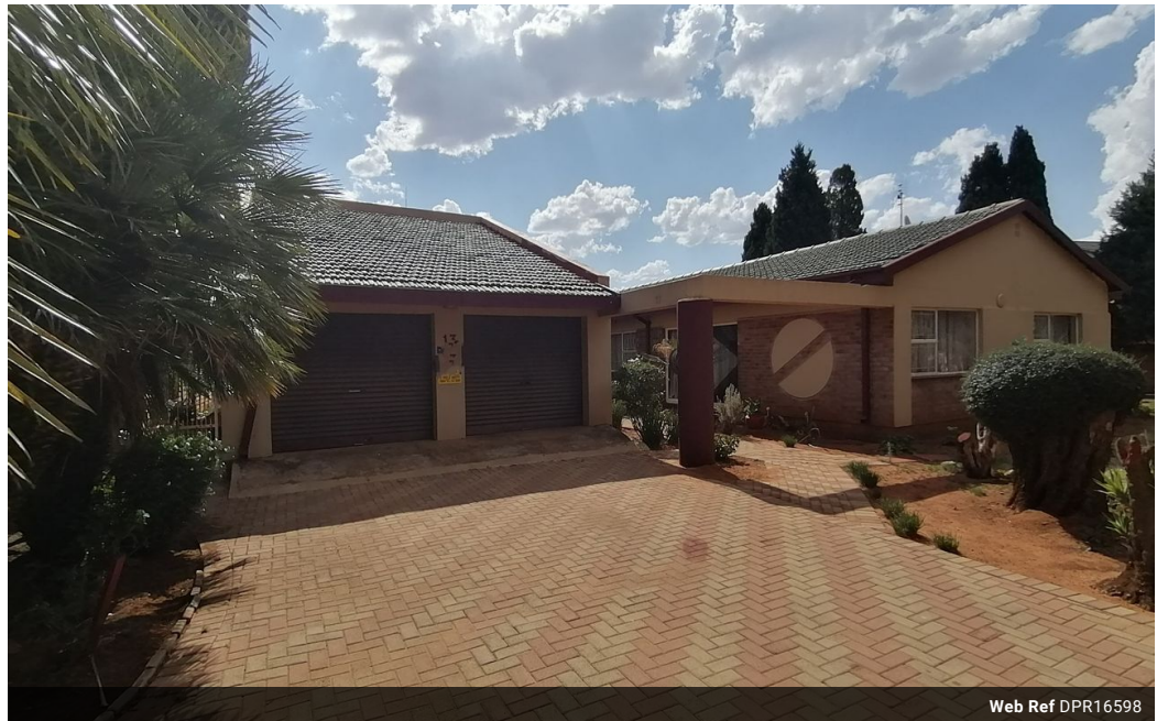
Web Ref DPR16598