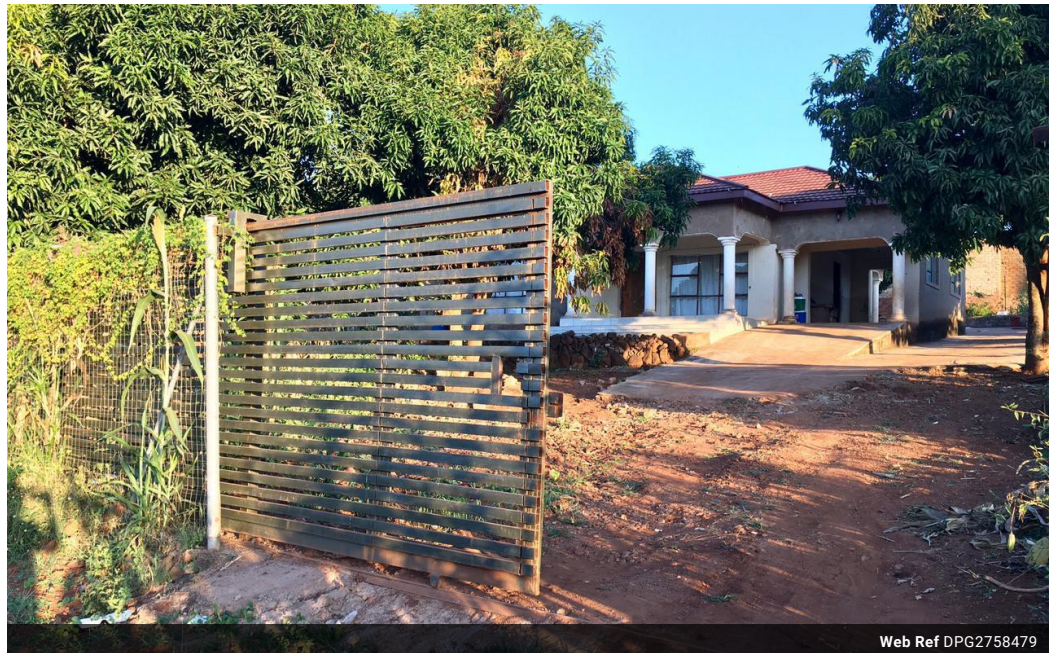
Web Ref DPG2758479

office no 4B Ndou Mall (behind Thulamela) Thohoyandou 0950