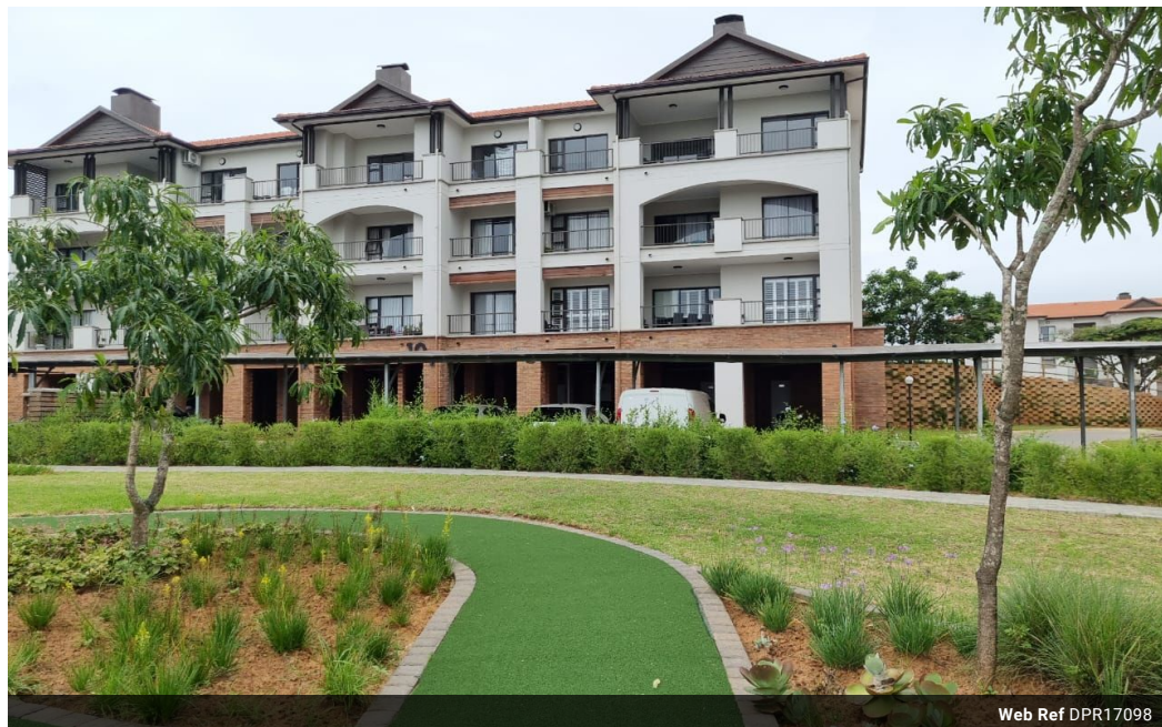
Web Ref DPR17098