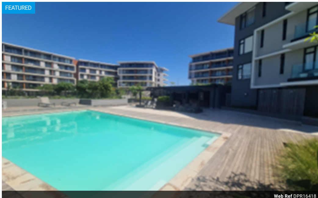
Web Ref DPR16418