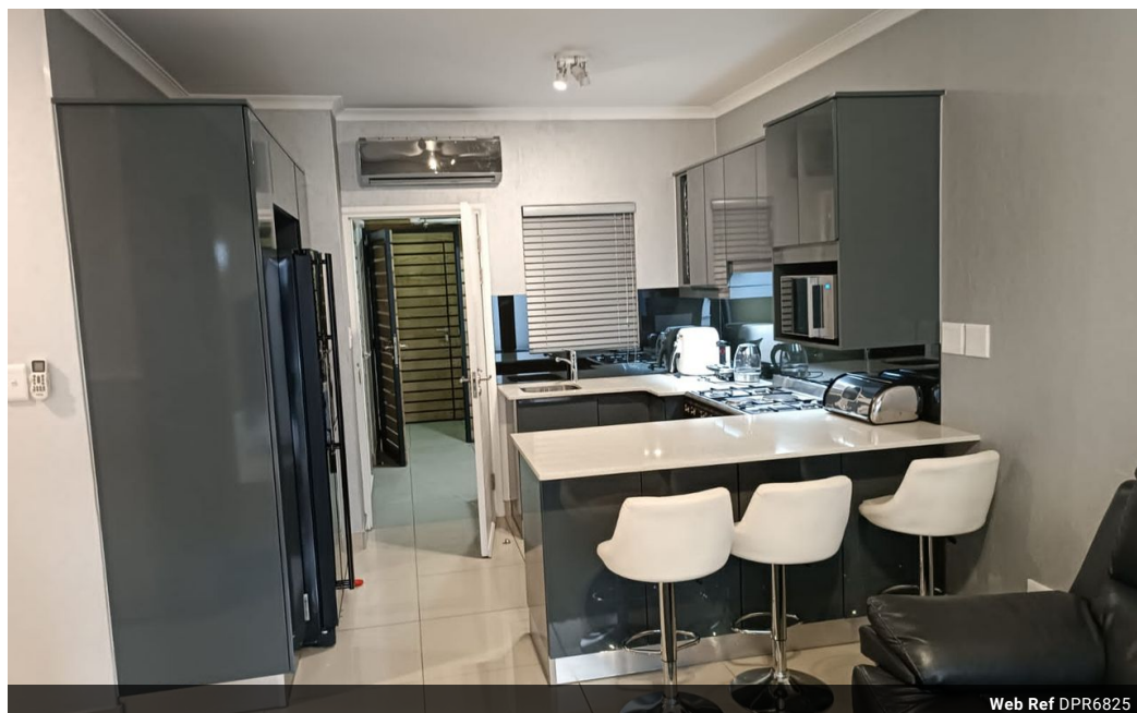
Web Ref DPR6825