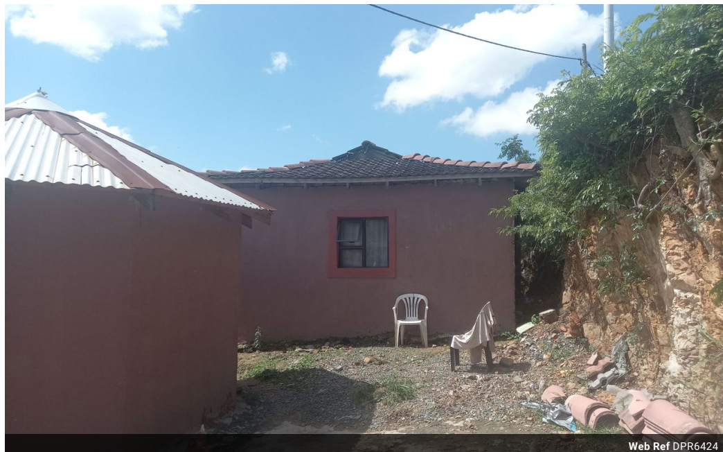
Web Ref DPR6424

343 Anton Lembede Street 511 Perm Building Durban 4001