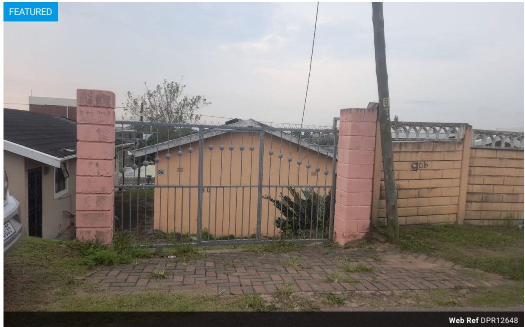
Web Ref DPR12648