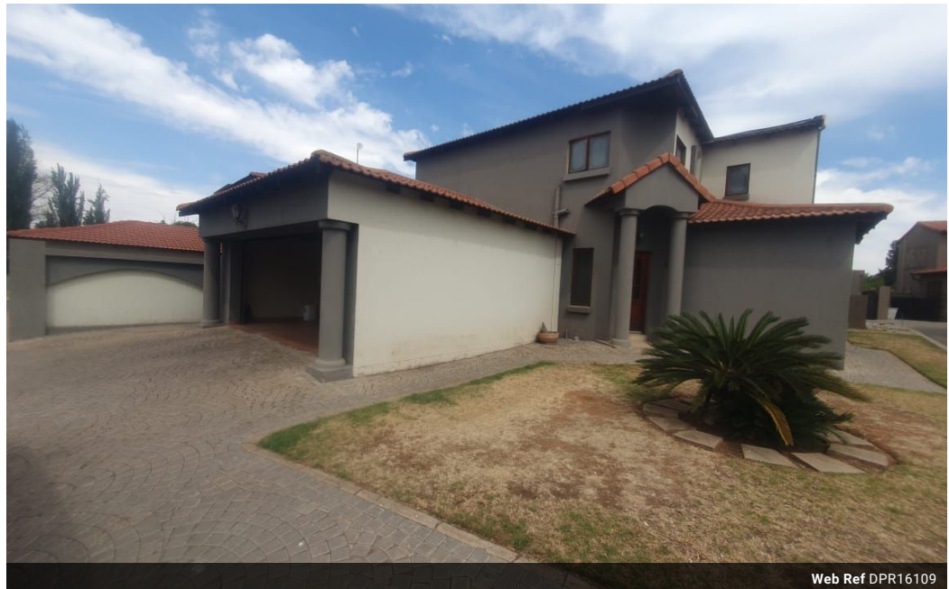
Web Ref DPR16109

24 Glynn Street Rothdene, Meyerton, 1961