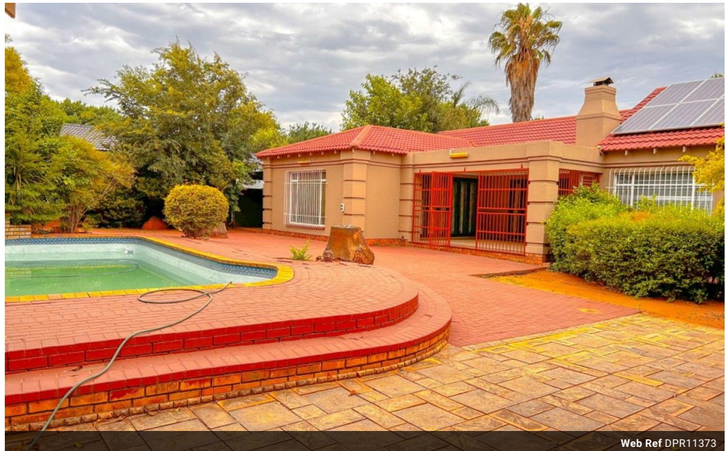
Web Ref DPR11373

Shop 2, The Palms Shopping Center, Louis Trichardt Blvd, Vanderbijlpark, 1911