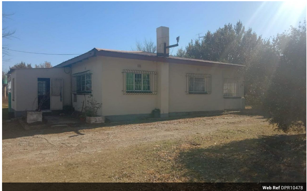
Web Ref DPR10478

Shop 2, The Palms Shopping Center, Louis Trichardt Blvd, Vanderbijlpark, 1911