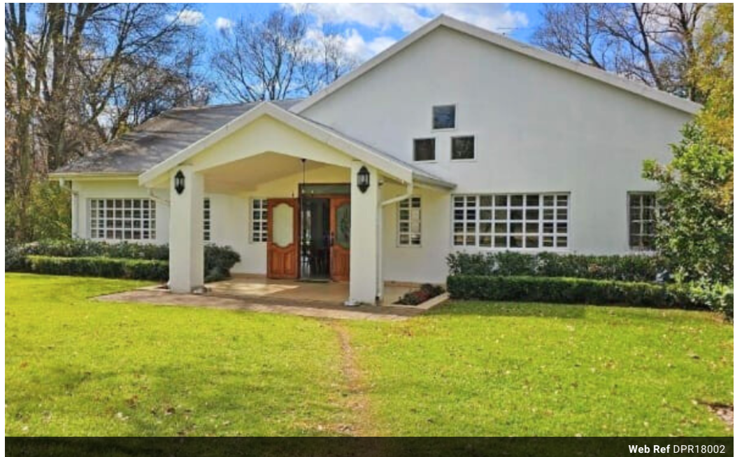
Web Ref DPR18002

Shop 2, The Palms Shopping Center, Louis Trichardt Blvd, Vanderbijlpark, 1911