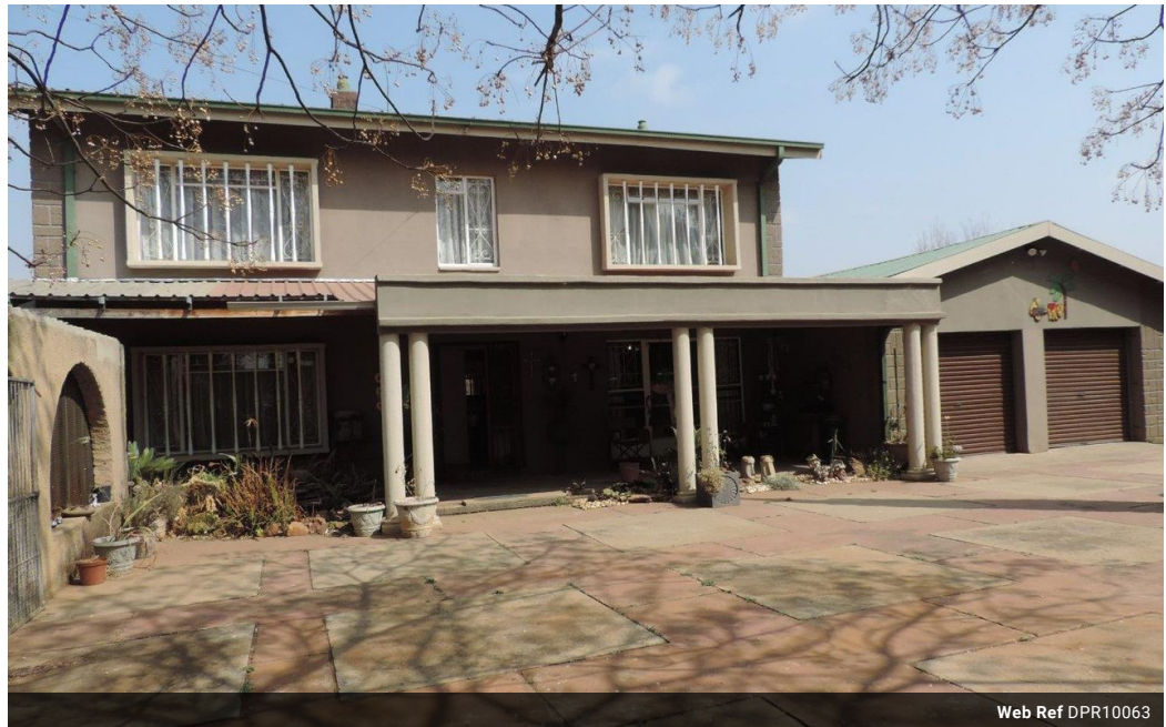
Web Ref DPR10063

Shop 2, The Palms Shopping Center, Louis Trichardt Blvd, Vanderbijlpark, 1911