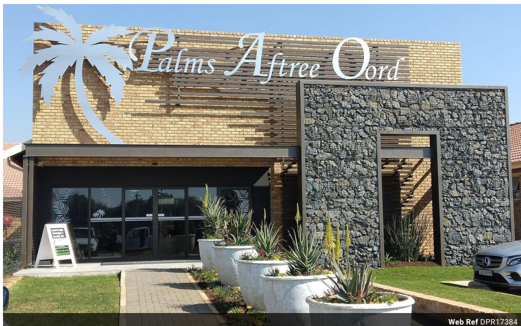
Web Ref DPR17384

Shop 2, The Palms Shopping Center, Louis Trichardt Blvd, Vanderbijlpark, 1911