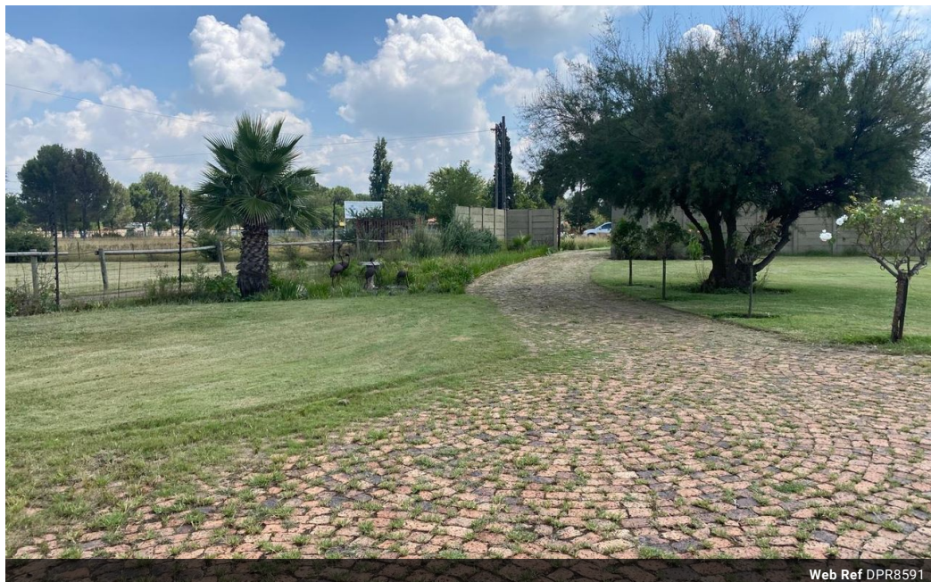
Web Ref DPR8591

Shop 2, The Palms Shopping Center, Louis Trichardt Blvd, Vanderbijlpark, 1911