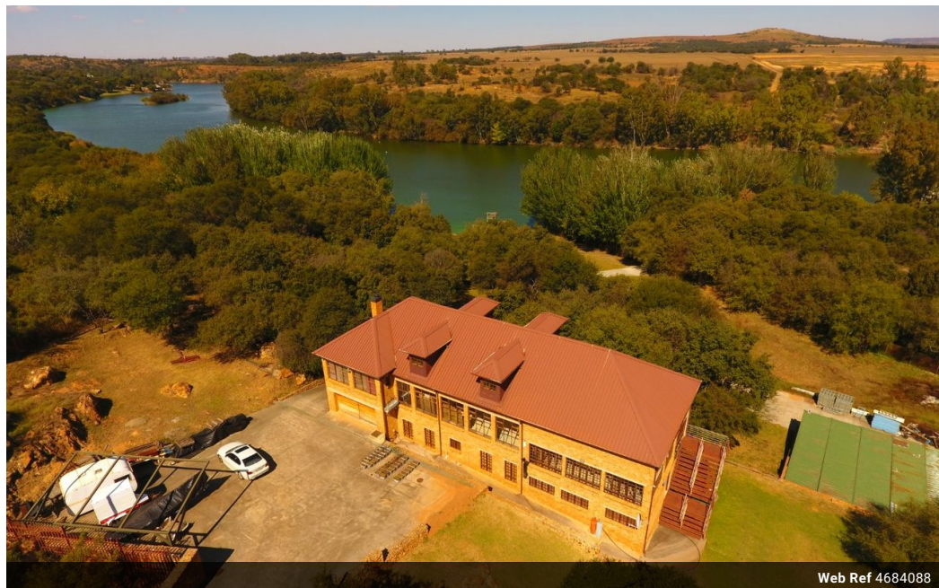
Web Ref 4684088

18 Klip River Drive, Three Rivers, Vereeniging