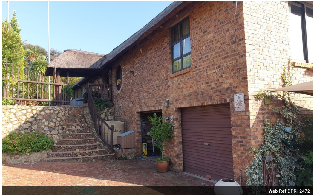
Web Ref DPR12472

Shop 2, The Palms Shopping Center, Louis Trichardt Blvd, Vanderbijlpark, 1911