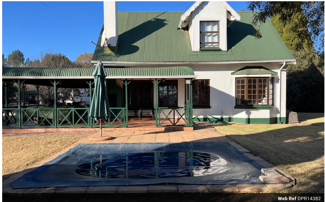
Web Ref DPR14382

Shop 2, The Palms Shopping Center, Louis Trichardt Blvd, Vanderbijlpark, 1911