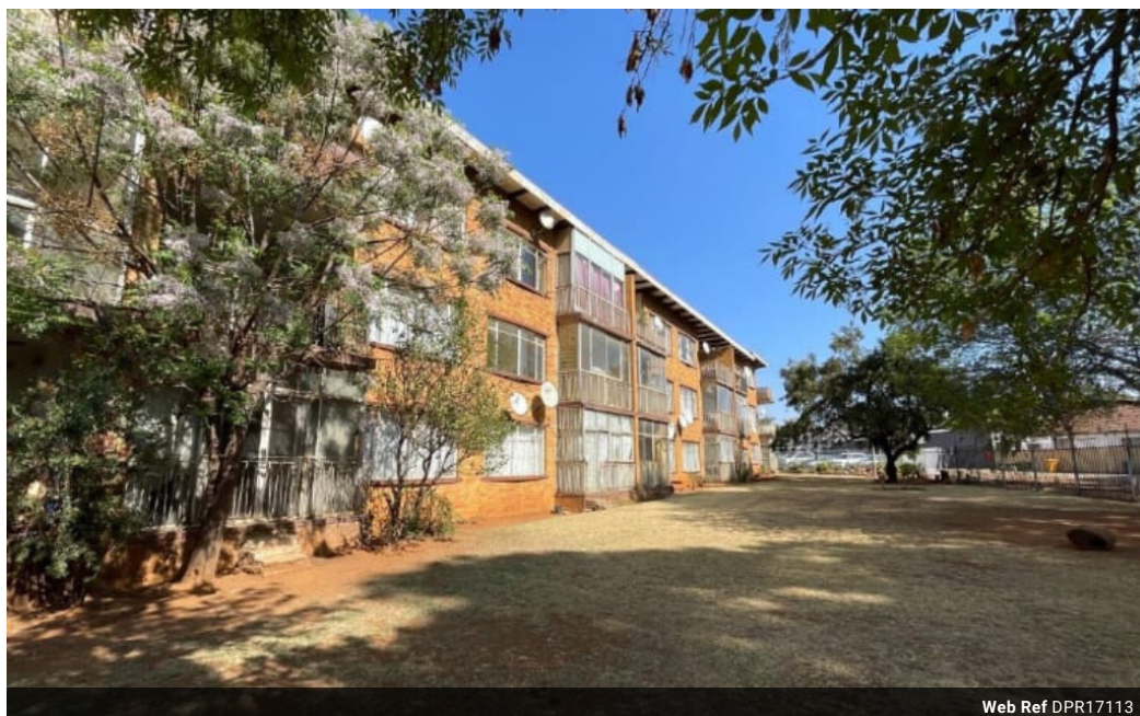
Web Ref DPR17113

Shop 2, The Palms Shopping Center, Louis Trichardt Blvd, Vanderbijlpark, 1911