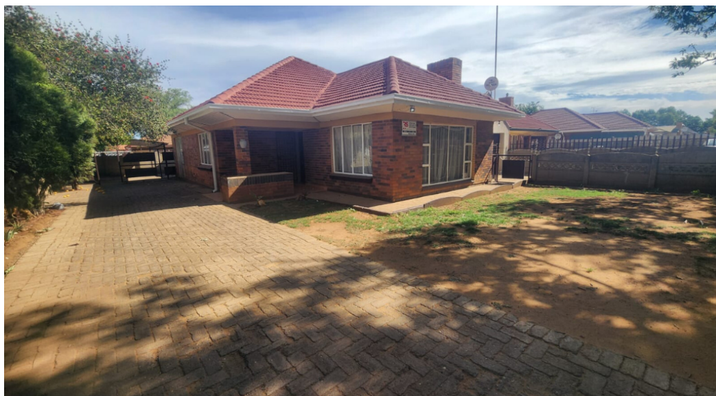
Web Ref DPR16451

Shop 2, The Palms Shopping Center, Louis Trichardt Blvd, Vanderbijlpark, 1911