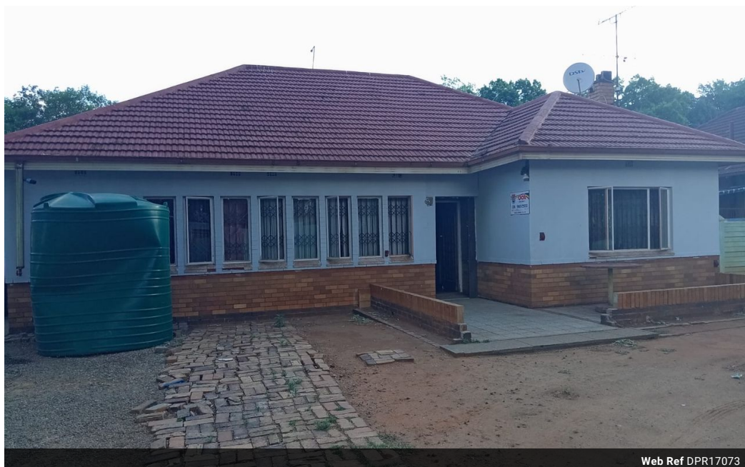
Web Ref DPR17073

Shop 2, The Palms Shopping Center, Louis Trichardt Blvd, Vanderbijlpark, 1911