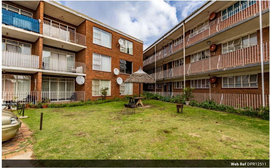
Web Ref DPR12511

Shop 2, The Palms Shopping Center, Louis Trichardt Blvd, Vanderbijlpark, 1911