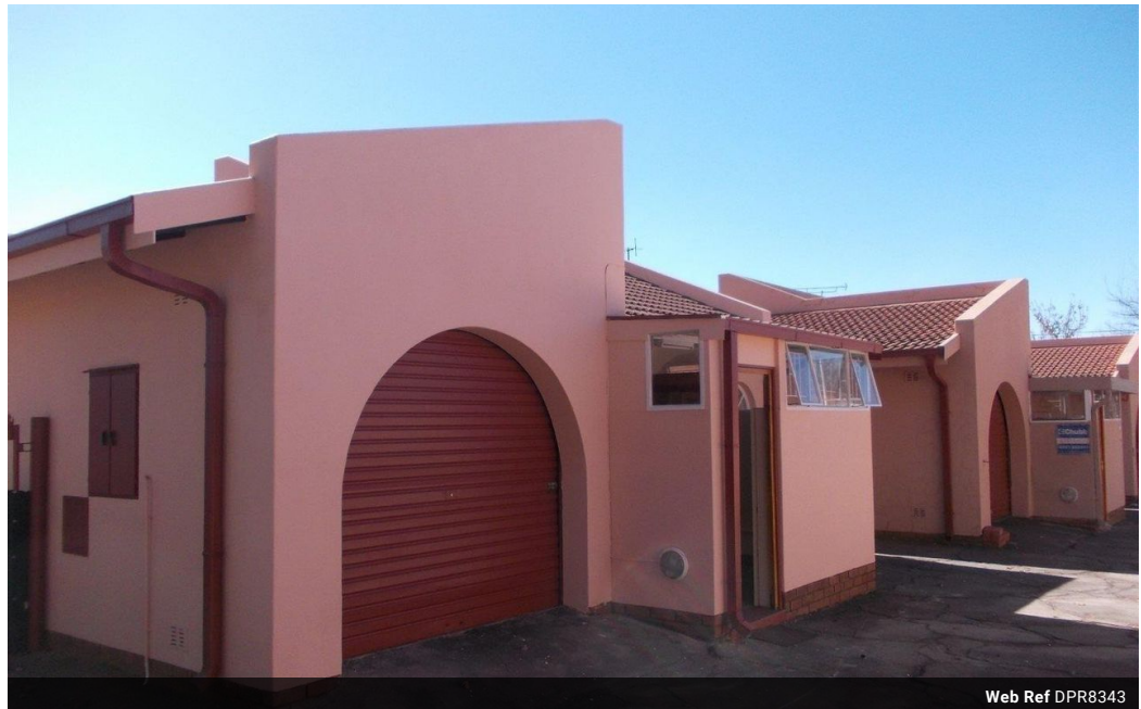
Web Ref DPR8343

Shop 2, The Palms Shopping Center, Louis Trichardt Blvd, Vanderbijlpark, 1911