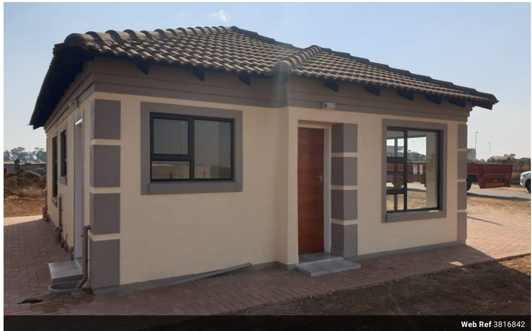
Web Ref 3816842

18 Klip River Drive, Three Rivers, Vereeniging