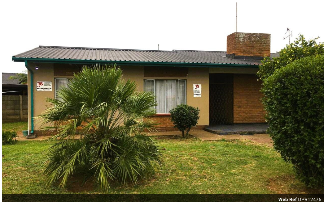
Web Ref DPR12476

Shop 2, The Palms Shopping Center, Louis Trichardt Blvd, Vanderbijlpark, 1911